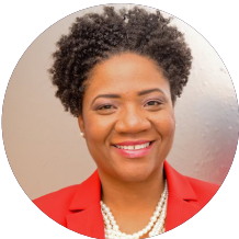
THE HONORABLE DEANA HOLIDAY INGRAHAM Mayor of East Point, GA